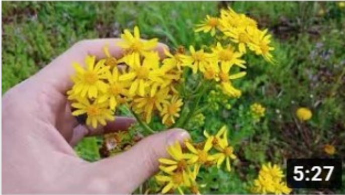
Weekly Weed Watch: Cressleaf Groundsel

Corn, soybean, and wheat farmers face a number of uncertainties every growing season, but the one constant is that weeds will exist in their fields. A new YouTube video series called the “Weekly Weed Watch” was launched in March of 2021. The series releases one video a week highlighting a weed species that is of relevance for corn, soybean, and wheat farmers for that time of the growing season.