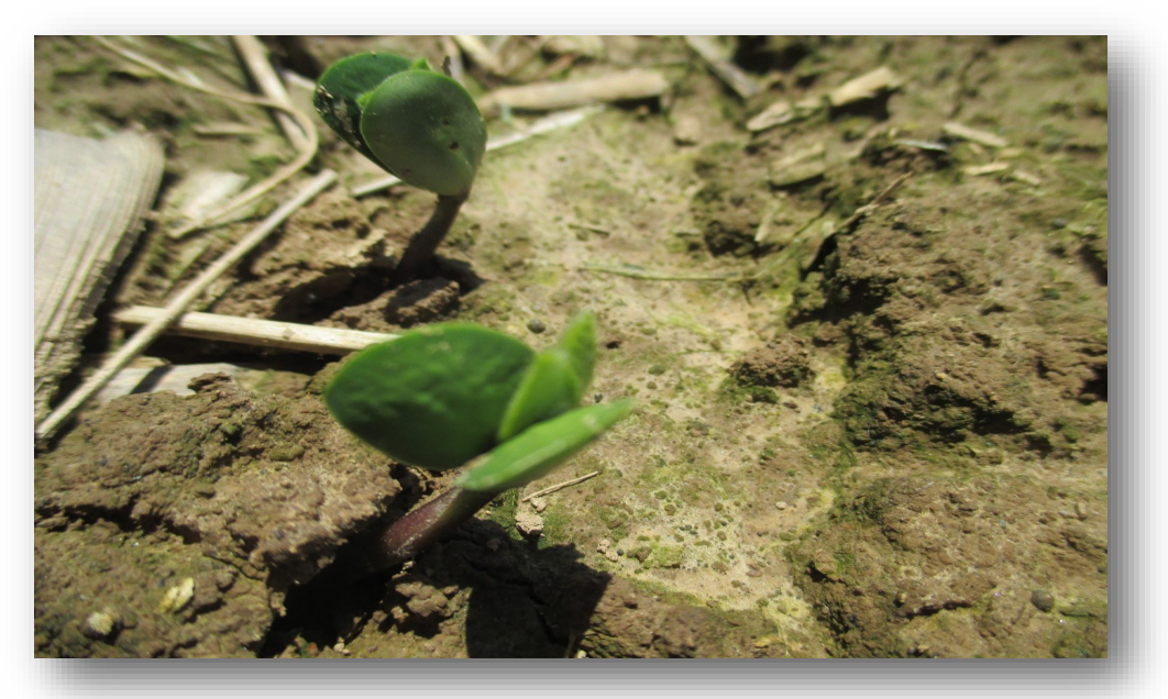
Figure 1. Soybean seedlings at VE (emergence) growth stage.

In general, to maximize the chances of successful soybean establishment and the best chances for maximum yield, conditions at planting and following should be: